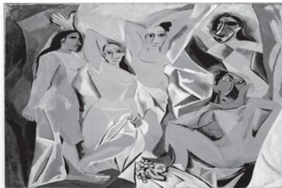
Painting 3: ' Les Femmes d'Alger (O Version O) ' (1907), Pablo Picasso

From the expressive orgy of colours of Fauves, the Western painting took a glib transition to a different form of art which has geometry in its origin, that is - Cubism. As with the eruption of war, the earlier forms and formats of painting were not being able to face and uphold the upheaval of the period, Merija says, - "The violent disjunctures of Cubist collage...were a fitting way to express the political and geographic revolution" (Merjia, 2014) However, this famous form of art emerged under the leadership of two of the most gifted artists that Western art history has ever witnessed - Pablo Picasso and Georges Braque (Kleiner, 2009, p. 921).