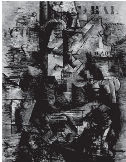
Painting 4: ‘ The Portuguese ’ (1911), Analytic cubism in practice by Georges Braque

Though it seems that the Cubist painters are much concerned with the proportions of the figures that they are drawing, (the name of the genre itself is derived from geometry) French writer and theorist Guillaume Apollinaire (1880-1918) explains how a cubist painting is not merely another geometric figure, says – “even in a simple cubism, the geometrical surfaces of an object must be opened out in order to give a complete representation of it”, but he also adds that – “Cubism [is] the art of depicting new wholes with formal elements borrowed not from the reality of vision, but from that of conception. This tendency leads towards a poetic kind of painting which stands outside the world of observation” (As cited in Kleiner, 2009, p.921).