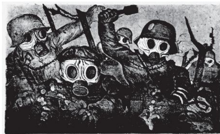
Painting 6: 'Shock Troops Advance under Gas from The War' (1924), German Expressionism, Otto Dix

Later, Picasso and Braque developed another style of painting famously known as synthetic cubism. Kleiner has defined it as a way of painting in which- 'artists constructed paintings and drawings from objects and shapes cut from the paper or other materials to represent parts of an object.' (2009, p.922) Picasso's 'Guitar, sheet music and wine glass' (1912), and Violin (1915) are examples of synthetic cubism.