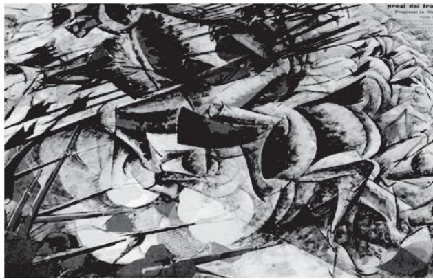
Painting 7: ‘Charge of the Lancers’, (1915), Italian Futurism, Umberto Boccioni