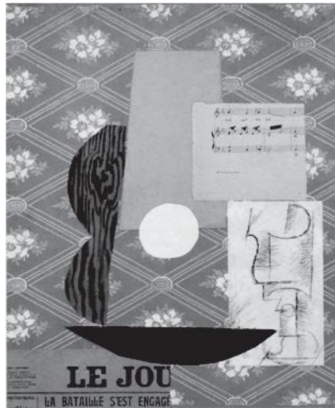
Painting 5: 'Guitar, sheet music and wine glass' (1912), synthetic cubism, Pablo Picasso.

Later, Picasso and Braque developed another style of painting famously known as synthetic cubism. Kleiner has defined it as a way of painting in which- 'artists constructed paintings and drawings from objects and shapes cut from the paper or other materials to represent parts of an object.' (2009, p.922) Picasso's 'Guitar, sheet music and wine glass' (1912), and Violin (1915) are examples of synthetic cubism.