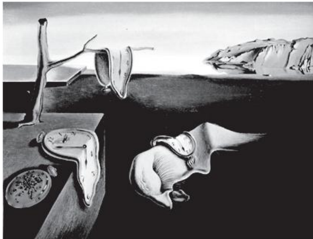
Painting 10: 'The Persistence of Memory' (1931), surrealism, Salvador Dali