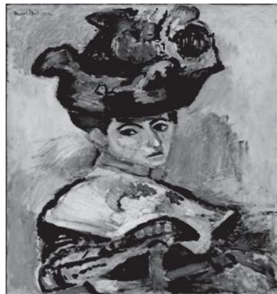
Painting 1: ‘Femme au chapeau’ or ‘woman with a hat’ (1905), Fauvist painting, Henry Matisse