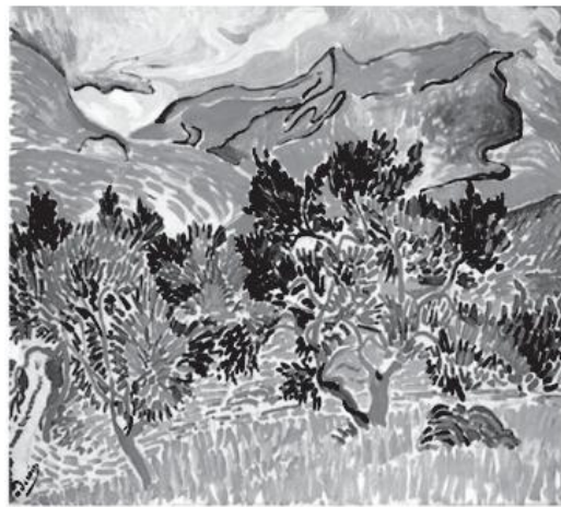
Painting 2: 'Mountains at Collioure' (1905), Fauvist painting, Andre Derain.

Matisse was greatly influenced by Fauvist movement in which the use of color was depended on an assortment of artists surveillance and sensation. He pushed this independence of color further. Some of the quintessential examples of Matisse's art works are ' Femme au chapeau ' (woman with a hat) and ' La Bonheur de vivre ' (The joy of life) and 'The Red Studio'. Andre Derain, the fauvist painter who was a contemporary of Matisse, considered painting as an intellectual rather than emotional medium. One of his very famous paintings is 'Mountains at Collioure'. Kleiner mentioned a famous art critic contemporary to the fauve painters-Louise Vauxcelles who was shocked by the "orgy of colours" in the works of Matisse, Derain and their colleagues at Salon d' Automne . He declared their pictures fauves or 'wild beasts' (Kleiner, 2009, p.911).